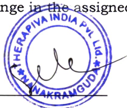
AUTHORIZED SIGNATORY THERAPIVA INDIA PRIVATE LIMITED