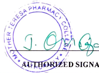
AUTHORIZED SIGNATORY MOTHER TERESA PHARMACY COLLEGE