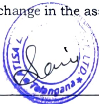
AUTHORIZED SIGNATORY ATISA LIFESCIENCES PRIVATE LIMITED